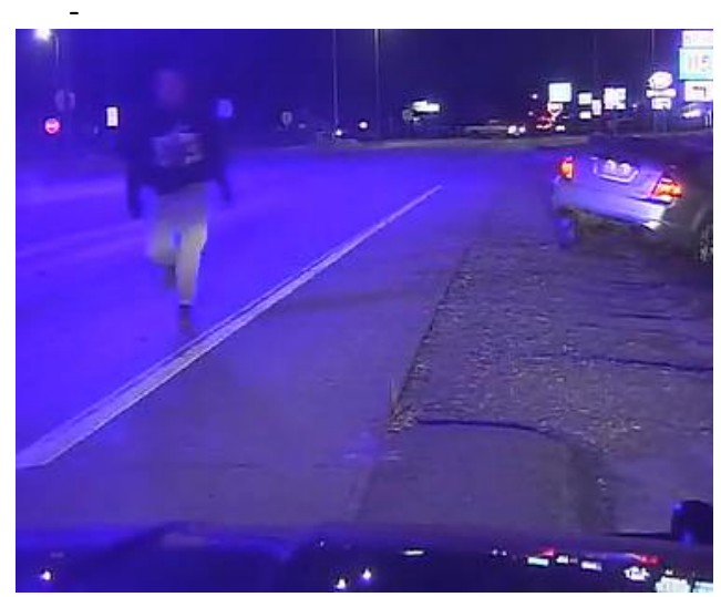
Still shot from SDHP dashcam of Bershad running toward the Trooper.